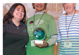
Green Team Awards