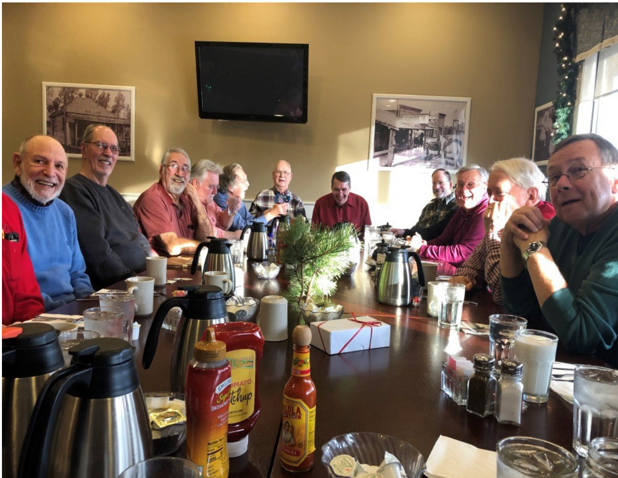
The Men's Group Celebrating (Table Decoration needs a little work).